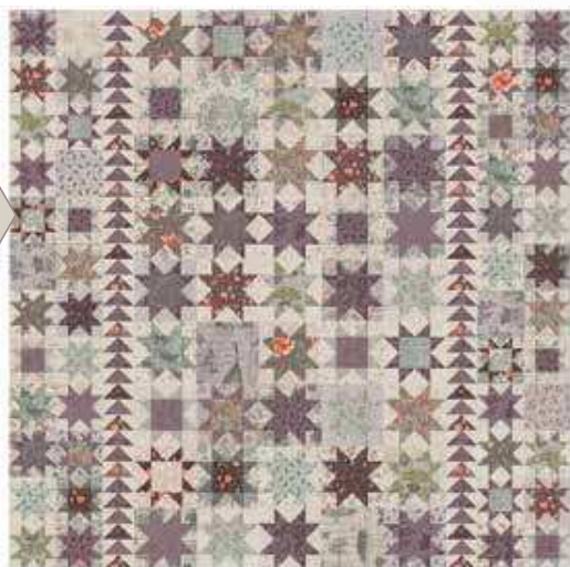
RQC 143 / RQC 143G What If You Fly? Size: 72" x 72"